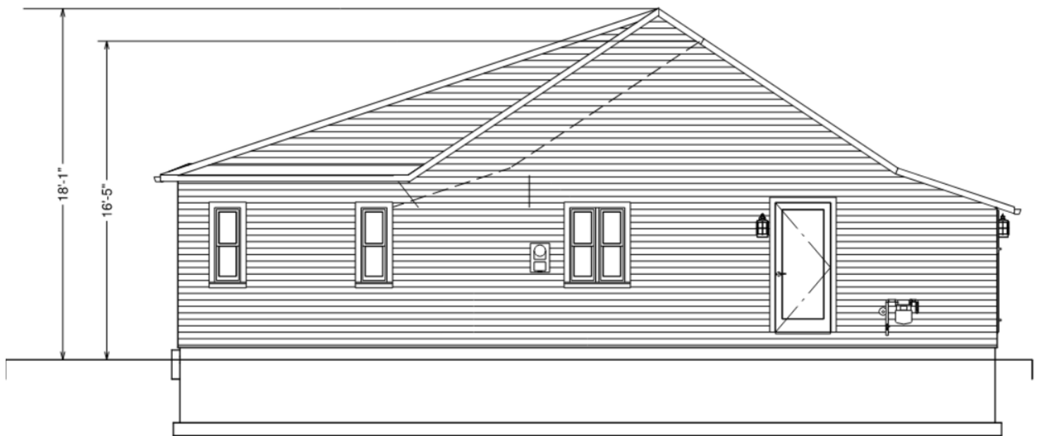
ELEVATION SCALE 3/16" = 1'-0"

Note: Alternative formats available upon request.