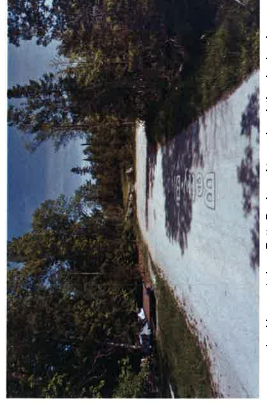
Looking east along Betty Boulevard towards existing dead end