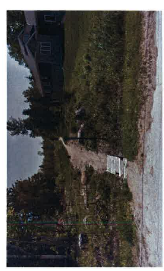
Looking east along Constance Boulevard towards existing dead end

Looking south at unopened Betty Boulevard ROW from Shore Lane