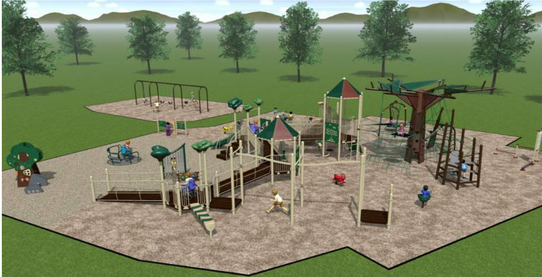
Town Hall - Mills Park