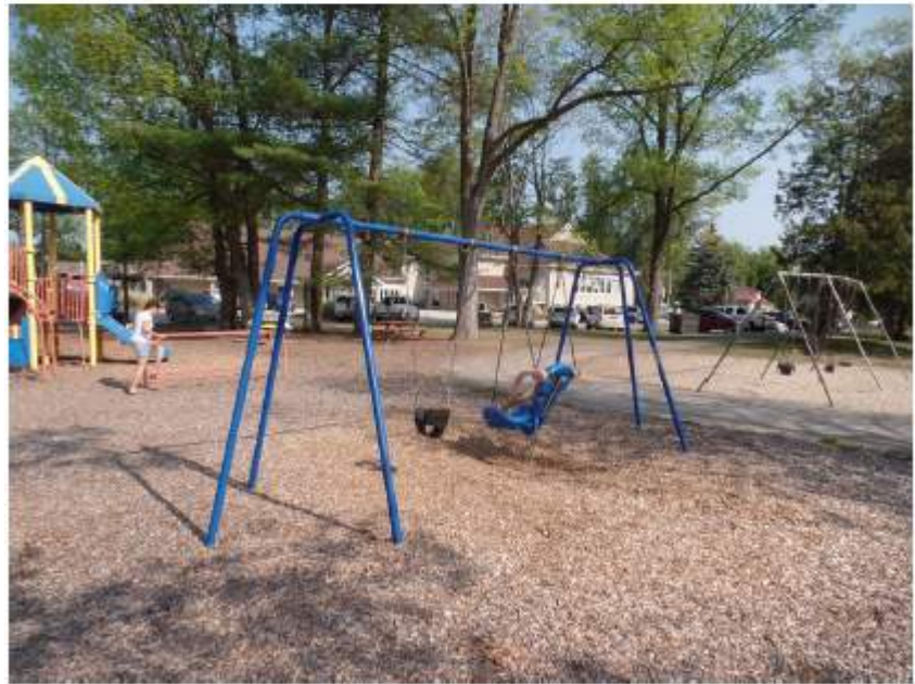
Town Hall - Mills Park