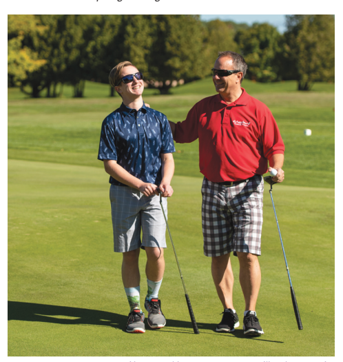
Young or old we guarantee you will make memories while playing golf in our community.