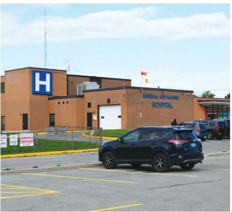
General and Marine Hospital in nearby Collingwood. The hospital is pursuing plans to build a new facility that will

Wasaga Beach is in close proximity to three hospitals and a community health centre.