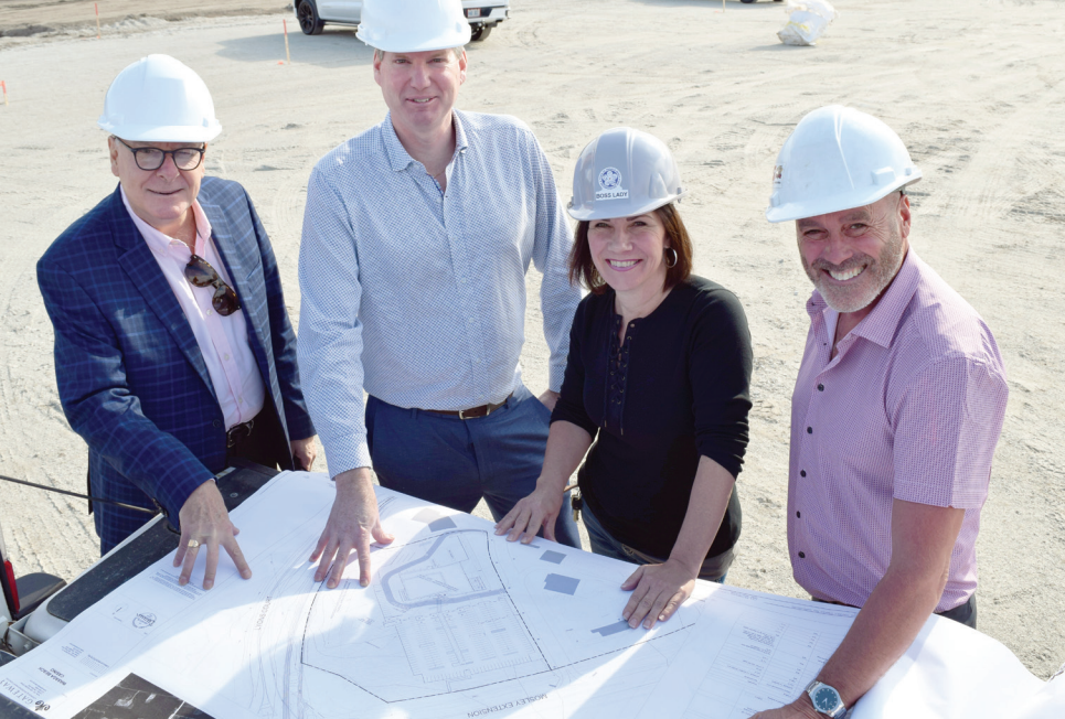
Construction of a casino, complete with great dining options, is underway in the west end of Wasaga Beach. Gateway Casinos is spearheading the project

For more information about the casino project, see www. wasagabeach.com.