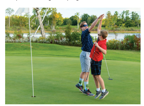
The region is also home to a number of other courses

Monterra Golf at Blue Mountain Resort, opened in 1989, is home to 18-holes near the base of the escarpment, just 35 minutes west of Wasaga Beach. Like many other courses, Monterra offers a driving range, club rentals, and pretty much anything else you need for a great day of golf.