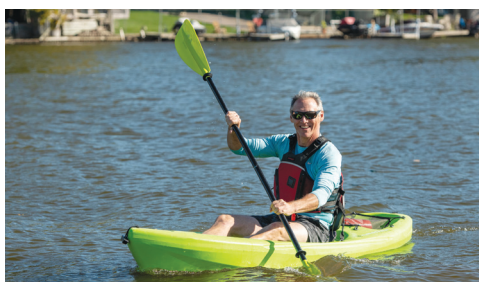
You will always see something new and interesting