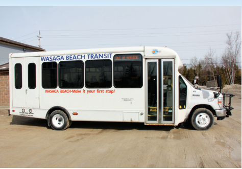
Wasaga Beach Transit is served by small buses like the one pictured. We have two transit routes in town. They run seven days a week. Connecting links are available to Collingwood and Barrie. From Barrie riders can access other destinations, including the GO Train and GO Bus to Toronto.

You can get around Wasaga Beach in a variety of different ways.