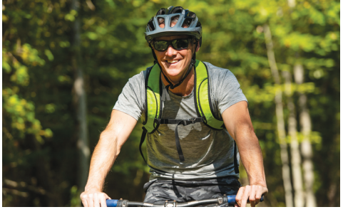
cling in Wasaga Beach Provincial Park is a beautiful way to experience our community. So peaceful. So quiet. And so much nature to see