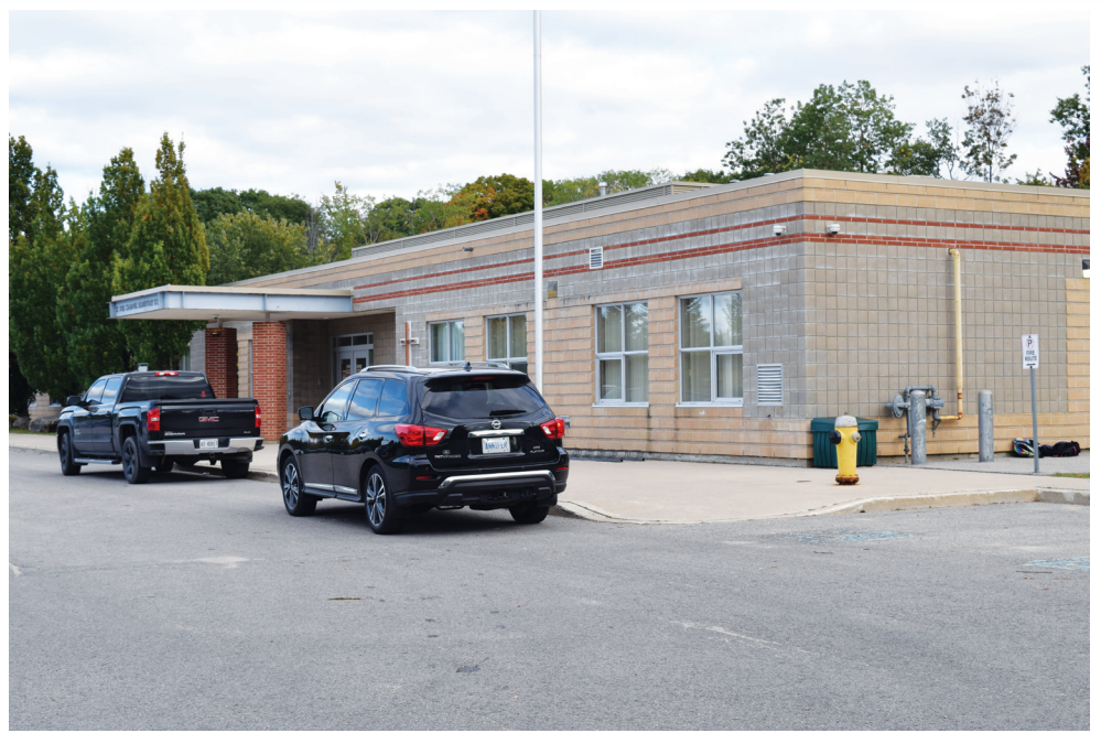
St. Noel Chahanel Catholic School in the west end of town serves Catholic families