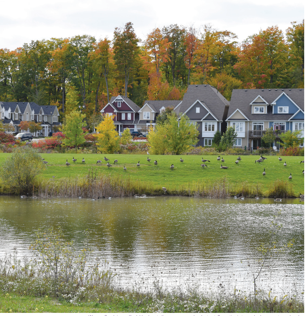
Wasaga Beach is an affordable place to live or own a weekend retreat. Properties in town also have great re-sale value

For more information on the Parkbridge communities in Wasaga Beach, see www.parkbridge.com.