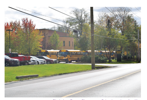
Birchview Dunes Elementary School services families living in the east end of the community