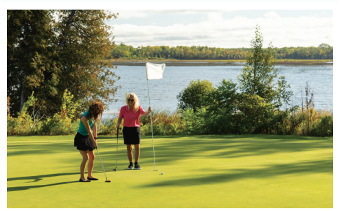
Wasaga Beach's Marlwood Golf and Country Club is a great place to play.

If you like to golf then Wasaga Beach and surrounding area offers plenty of spots to swing a club.