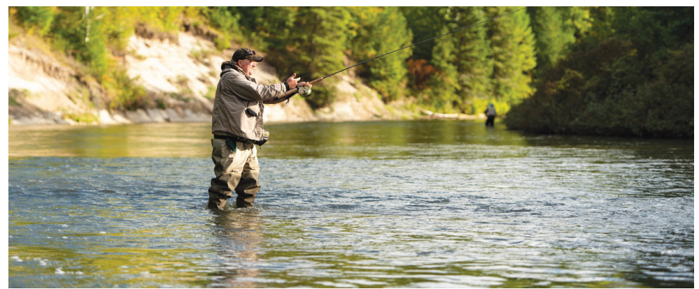
ishing in the Nottawasaga River is a popular pastime with residents and visitors. Nottawasaga Bay offers great opportunities as we

From Wasaga Beach, with the right charts, you can boat to other nearby communities, including Collingwood, Thornbury, Meaford, Penetanguishene, and Midland.