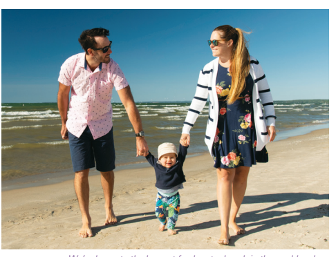
are proud of it. You can walk our beach 365 days of the year