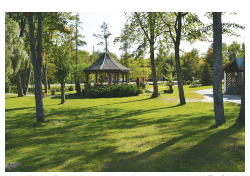
Wasaga Beach is home to dozens of parks and green spaces. The Oakview Woods Gazebo is a relaxing spot next to our RecPlex. In the summer months, our popular Jazz in the Park concert series takes place here.

Wasaga Beach has more than 100 kilometres of both onroad and off-road trails. These trails offer wonderful places to wander throughout the year. The town manages some of these trails, while the rest are part of Wasaga Beach Provincial Park. Be sure to check out our Story Book Trails. One starts at 40th Street South and Cardinal Way and the other at the eastern entrance of Silver Birch Avenue and River Road West.