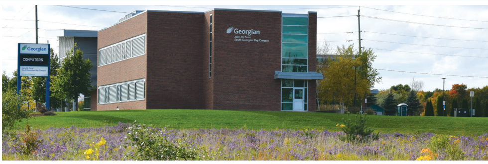
The South Georgian Bay Campus of Georgian College is just 20 minutes northwest of Wasaga Beach on the outskirts of Collingwood. The college has eight other campuses all within driving distance of Wasaga Beach. Public transit is available from Wasaga Beach to the South Georgian Bay Campus.

Although Wasaga Beach does not have any post-secondary institutions, the town is less than an hour drive to other Simcoe County communities that do offer such educational studies.