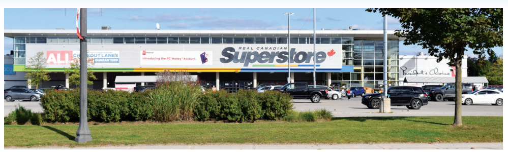
Wasaga Beach is home to three businesses offering groceries. Superstore in the west end of town, and Foodland and Walmart in the east end of the community. These stores offer a wide variety of choices.