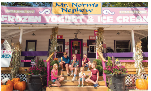
Our community is full of great little spots to explore. Looking for ice cream, cotton candy and other delectable treats? You need to check out Wasaga Beach.