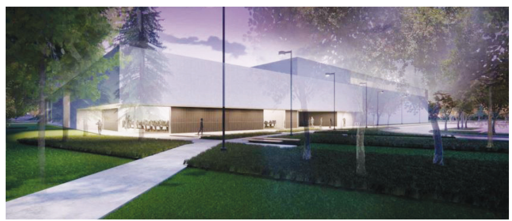
A rendering of the new twin-pad arena and library in Wasaga Beach. This depicts the east entrance

Additional information about this project is on our website at <a href="https://www.wasagabeach.com">www.wasagabeach.com</a> on the Build Wasaga page and on our community engagement website at <a href="https://www.letstalkwasaga-beach.ca">www.letstalkwasaga-beach.ca</a>.