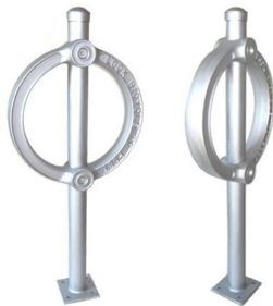
* Single/Bike Ring