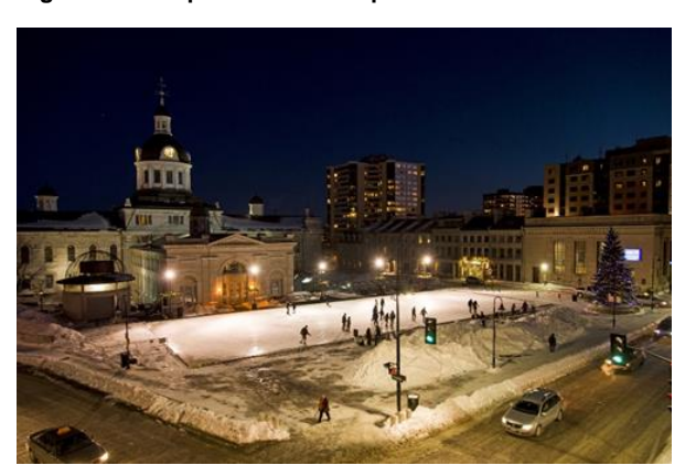
Figure 4: Examples of Public Squares

However, programming of the space will be equally important. The space at Lower Main should be used for important civic functions and be available for other events and festivals throughout the year. New public squares should be designed to maximize their flexibility so they can be used in all seasons and for the widest variety of uses. A high-quality public square that may be used for a farmer's market or an outdoor concert in the summer time, should be flexible to be used as a skating rink or a holiday market in the winter time.