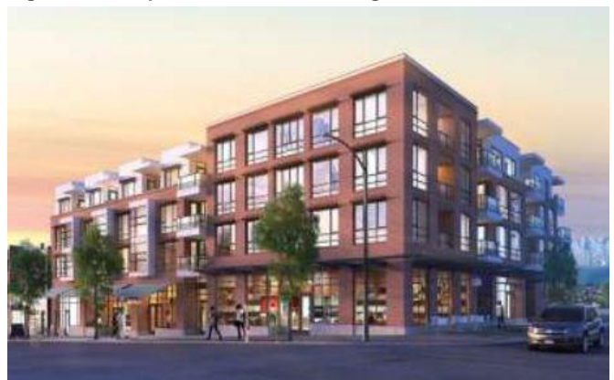
Figure 3: Examples of Potential Building Scale

Bungalow townhouses are also an alternative to traditional townhouses and have proven to be successful elsewhere in Wasaga Beach, including at the south end of the Downtown area in Stonebridge. The lack of stairs and smaller square footage of these units are particularly attractive to older buyers who are still interested in living in a ground-related unit as opposed to downsizing all the way to an apartment unit.