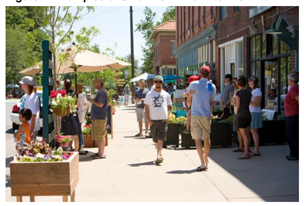
Figure 1: Examples of Small Town Downtowns

Public spaces in the Downtown, both indoor and outdoor, are typically very important for programming to attract people to the area and provide a space for community events. Consistent programming is key, and ongoing events drive positive awareness of the area and the wider Town for both residents and tourists. Downtowns with a range of retail, commercial, and programming options that span all seasons and appeal to the widest mix of people, including families and children, ensures that the area remains animated and thrives throughout the year.