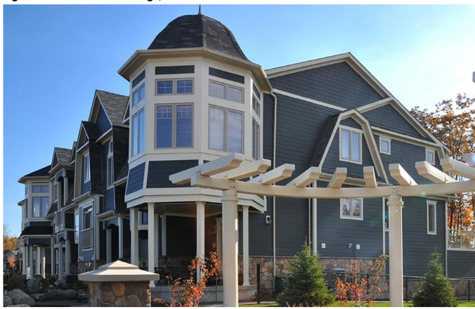
Figure 2: Homes in Stonebridge, near Main Street and River Road West