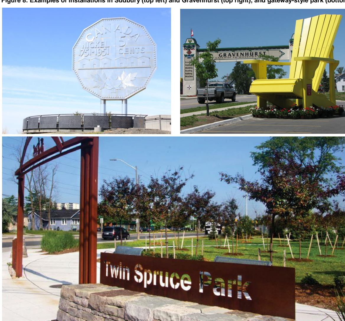
Figure 8: Examples of installations in Sudbury (top left) and Gravenhurst (top right), and gateway-style park (bottom)

Given the limited number of gateway locations in Wasaga Beach, it is important that they are designed well. Ideally, this site would be developed in a manner that is visually interesting, attractive, and memorable, and that has some function for the Town. Communities such as Gravenhurst, Sudbury, Wawa, and Kenora have all made use of similar sites by employing significant art installations that have become synonymous with their town and are now attractions in themselves ( Figure 8 ). While they may be tacky to some, their value as an attraction and as a landmark is undeniable. The Town of Wasaga Beach could even use the opportunity to create a contest whereby residents submit ideas for what they think is representative of Wasaga Beach for the installation at this gateway location.