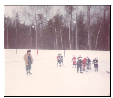
Oakview Outdoor Rink

Wasaga Beach had no arena in the 1960's. This 1969 picture shows the man-made hockey rink that was located at the Oakview Centre (now RecPlex). The boards were built by the "dads", lighting put up, and a little cabin was moved in for use as a change room and warming up. It's hard to believe that minor hockey in Wasaga was born on an outdoor rink. The dads would arrive first thing in the morning to shovel, clean and flood the rink before the games could start. Everyone was grateful if it didn't snow heavily the night before a game!